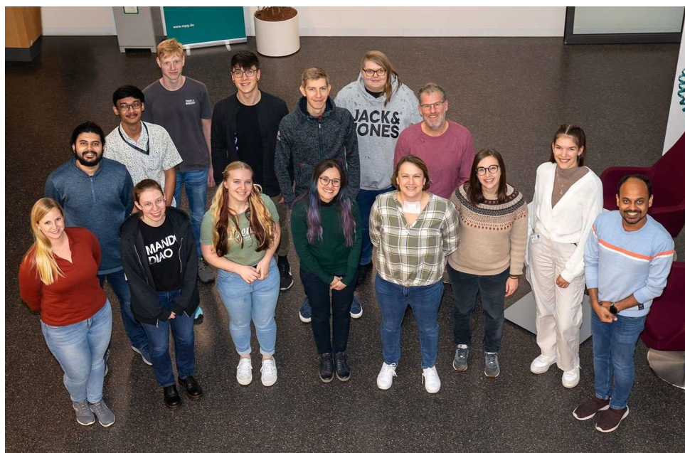
The Biolabs Team