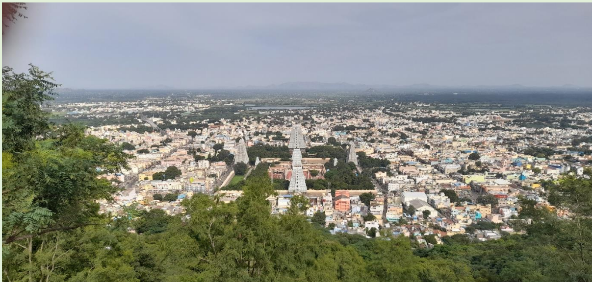
Tiruvannamalai town

Climate will be hot and arid from March to mid June. From mid June to Feb the climate will be pleasant and is a good time to visit Tiruvannamalai.