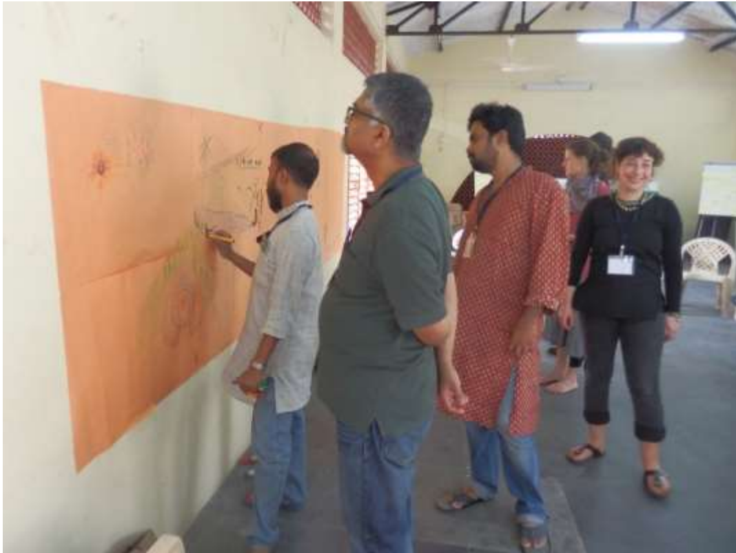
Painting for collective visioning