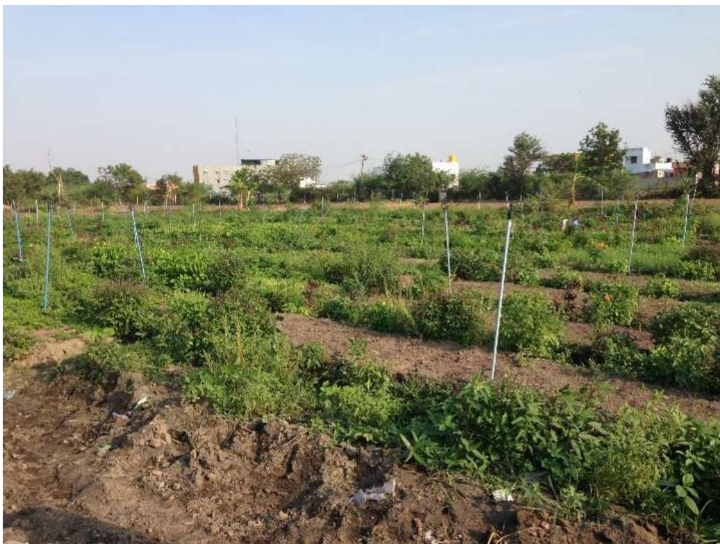
Nallakeerai organic farm