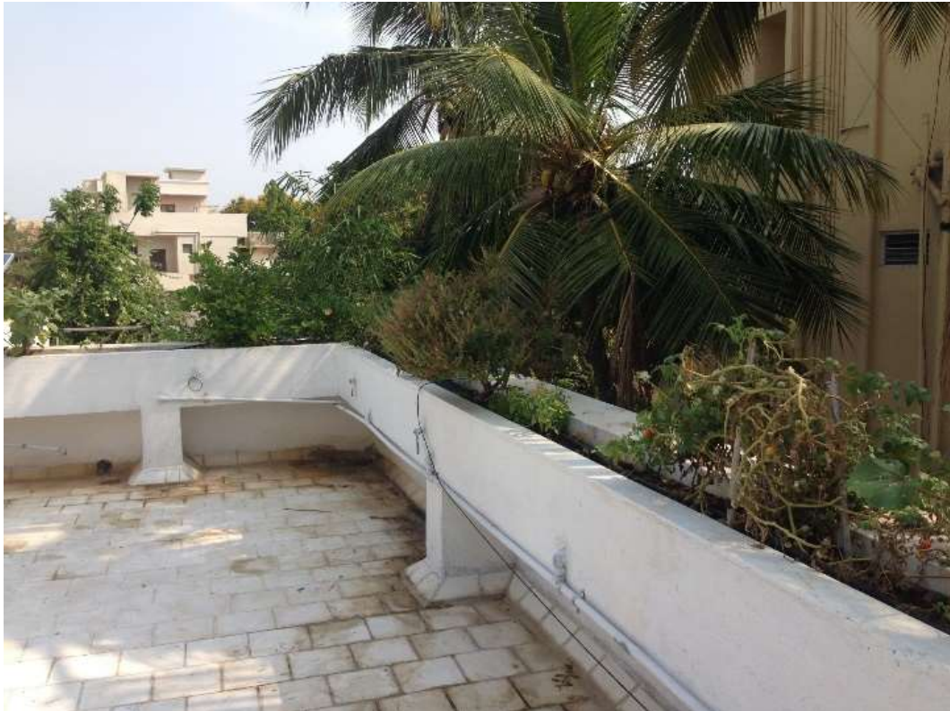
Roof top permaculture kitchen garden