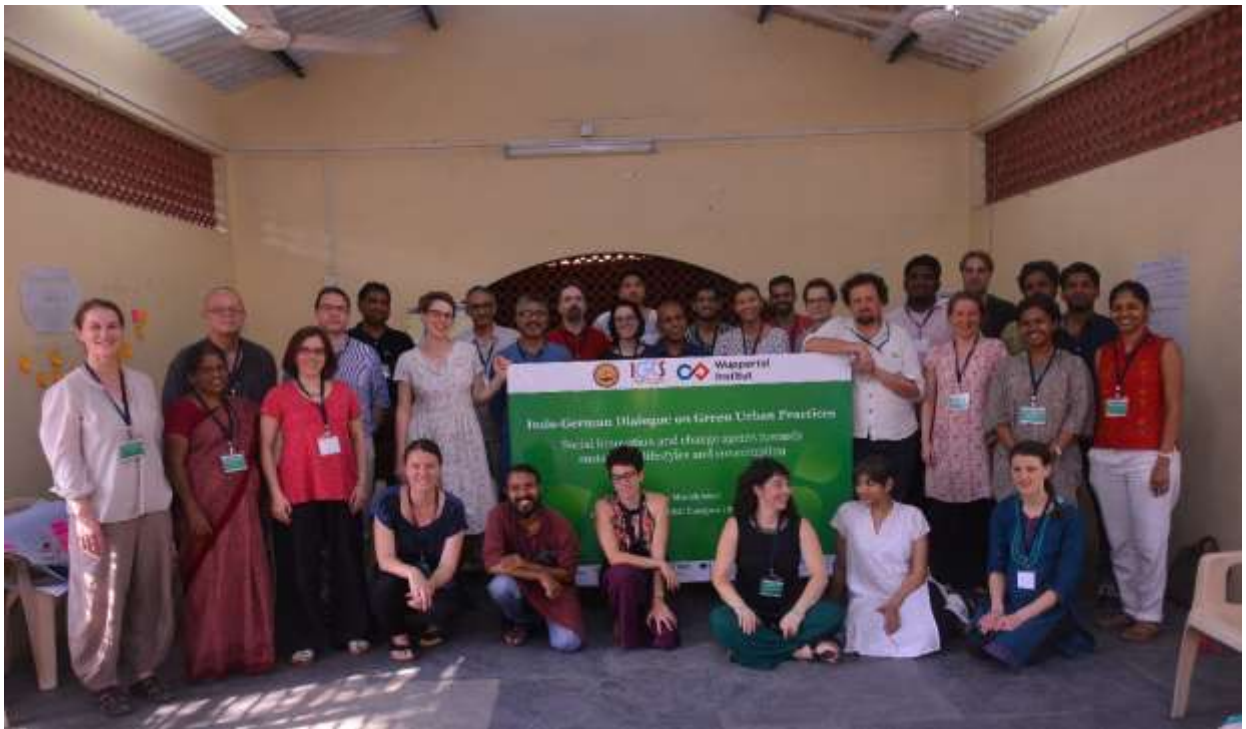
Participants of the Indo-German Dialogue